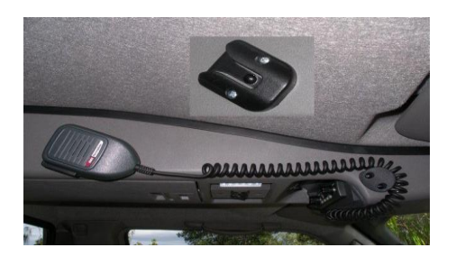
Microphone clip on acute angle