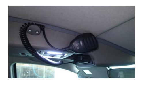
Left hand cable outlet radios