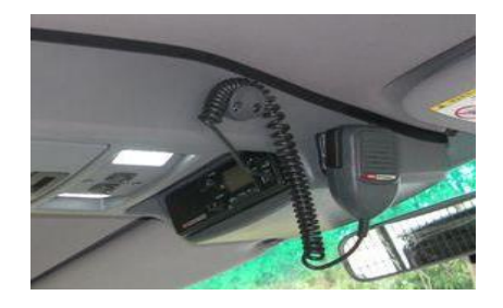
Microphone clip on slight angle

Install in a position that suits best, depending on vehicle and Radio model. Ensure microphone <u>or</u> microphone cable and holder does not foul on sun visor when pulled down.