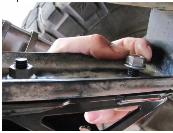
Tools: 17 mm socket and 16 mm spanner Torque wrench

The brackets are designed to move the sway bar position down and rearward