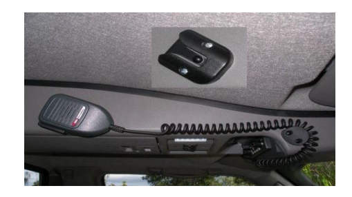
Microphone clip on acute angle