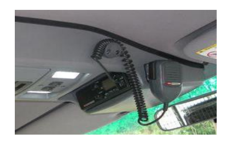
Microphone clip on slight angle

Install in a position that suits best, depending on vehicle and Radio model. Ensure microphone <u>or</u> microphone cable and holder does not foul on sun visor when pulled down.