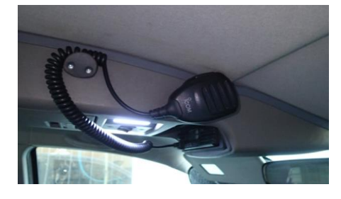
Left hand cable outlet radios