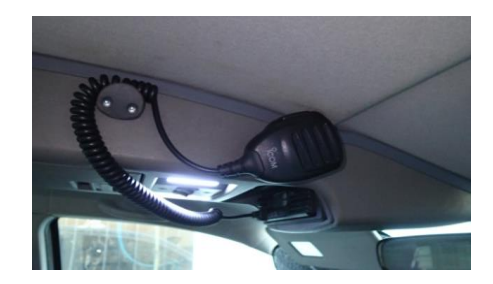
Left hand cable outlet radios