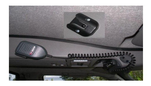
Microphone clip on acute angle