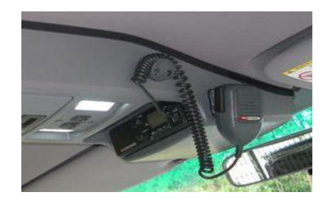
Microphone clip on slight angle

Install in a position that suits best, depending on vehicle and Radio model. Ensure microphone <u>or</u> microphone cable and holder does not foul on sun visor when pulled down.