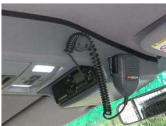
Install microphone clip on slight angle (same as console)