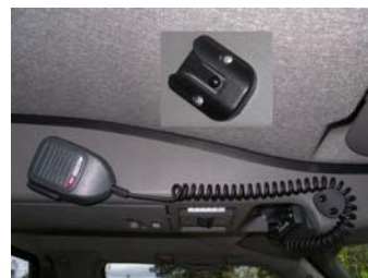
Install microphone clip on acute angle